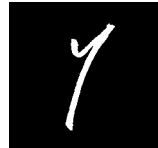
▲ Kiln mark/Potter's mark

Access: 20 minutes' drive from JR Karatsu Station