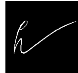
▲ Kiln mark/Potter's mark