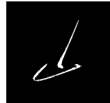
▲ Kiln mark/Potter's mark